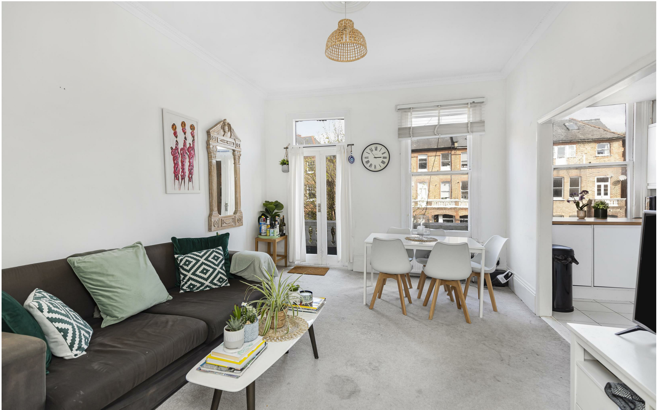
Goldhurst Terrace NW6